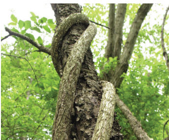
Invasive plants such as Oriental bittersweet crowd out and kill native plants.