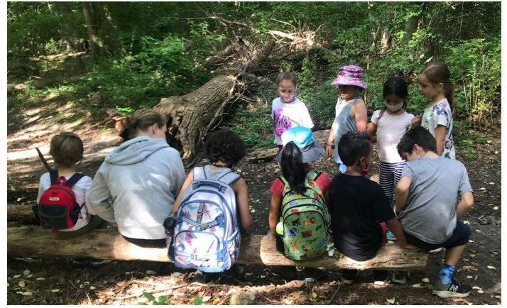
Fells Forest Camp provided valuable time-in-nature for more than 700 children this summer.