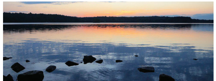
Sunset at Spot Pond.