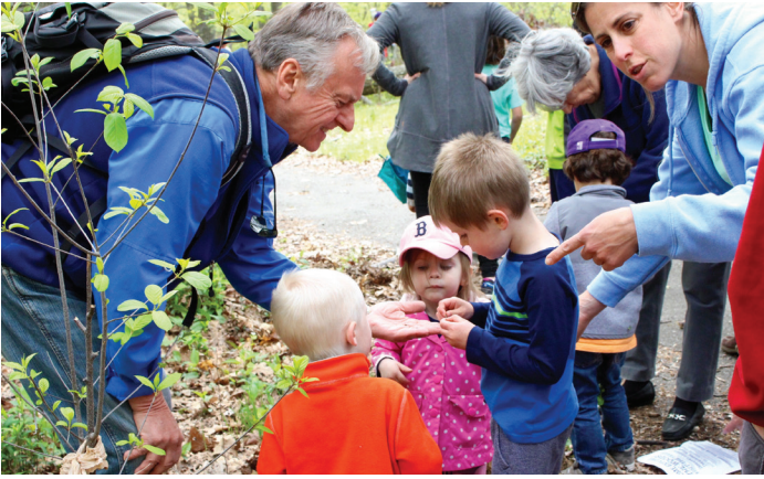
Babes in the Woods and Hike N Seek programs are back on the calendar after a pandemic hiatus.