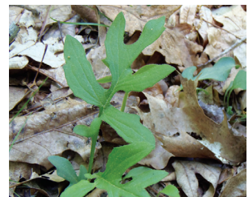
Lions Foot, endangered plant in the Fells.