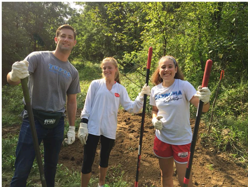
Incoming Tufts first-year students volunteer at 90 mm meadow