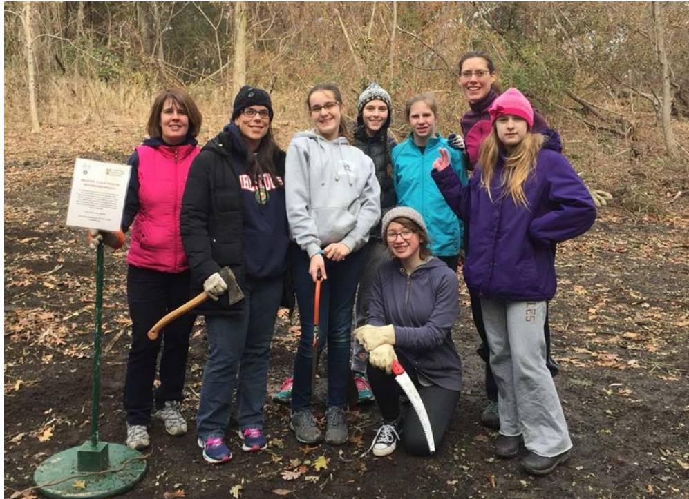
Medford Girl Scout Troop #75198 begin work at 90 mm meadow

Recent use of the 90 mm meadow in the Middlesex Fells Reservation: