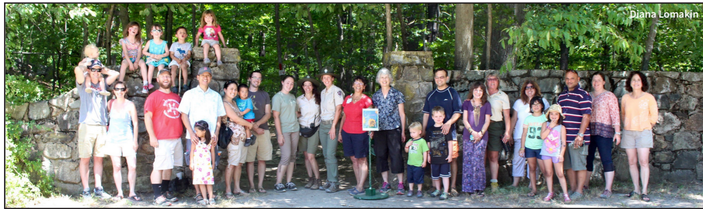
It's Summer! Festival

03 Summer Wildflowers at Bellevue Pond 9:15 - 11:30 AM Bellevue Pond, Medford There are some wonderful mid-summer wildflowers in bloom at Bellevue Pond in early August. Join Boot Boutwell for a walk focusing on wildflower ID as well as fun and interesting natural history. Meet at the Bellevue Pond Parking Lot, South Border Road, Medford. Steady rain cancels. Leader: Boot Boutwell (781-729-4712).