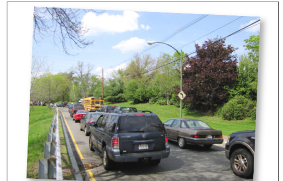
Don’t let this happen to Fells parkways!

Last month we filed opposition to the impacts of this project at the Massachusetts Appeals Court, but