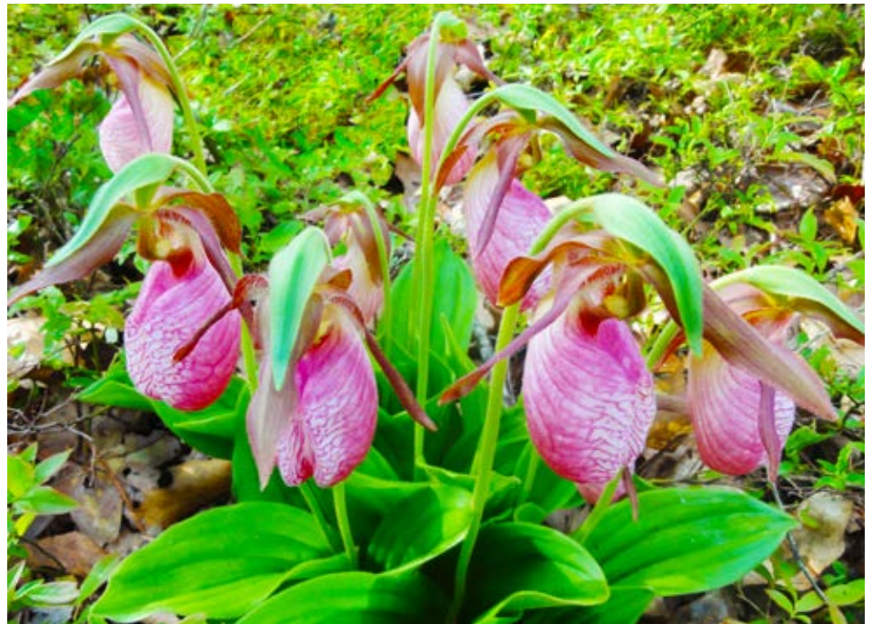
ABOVE: Pink lady's-slipper ( Cypripedium acaule ) flowers and fruits prolifically after fires, taking advantage of the extra sunlight and extra nutrients from the ash. (Walter Kittredge)