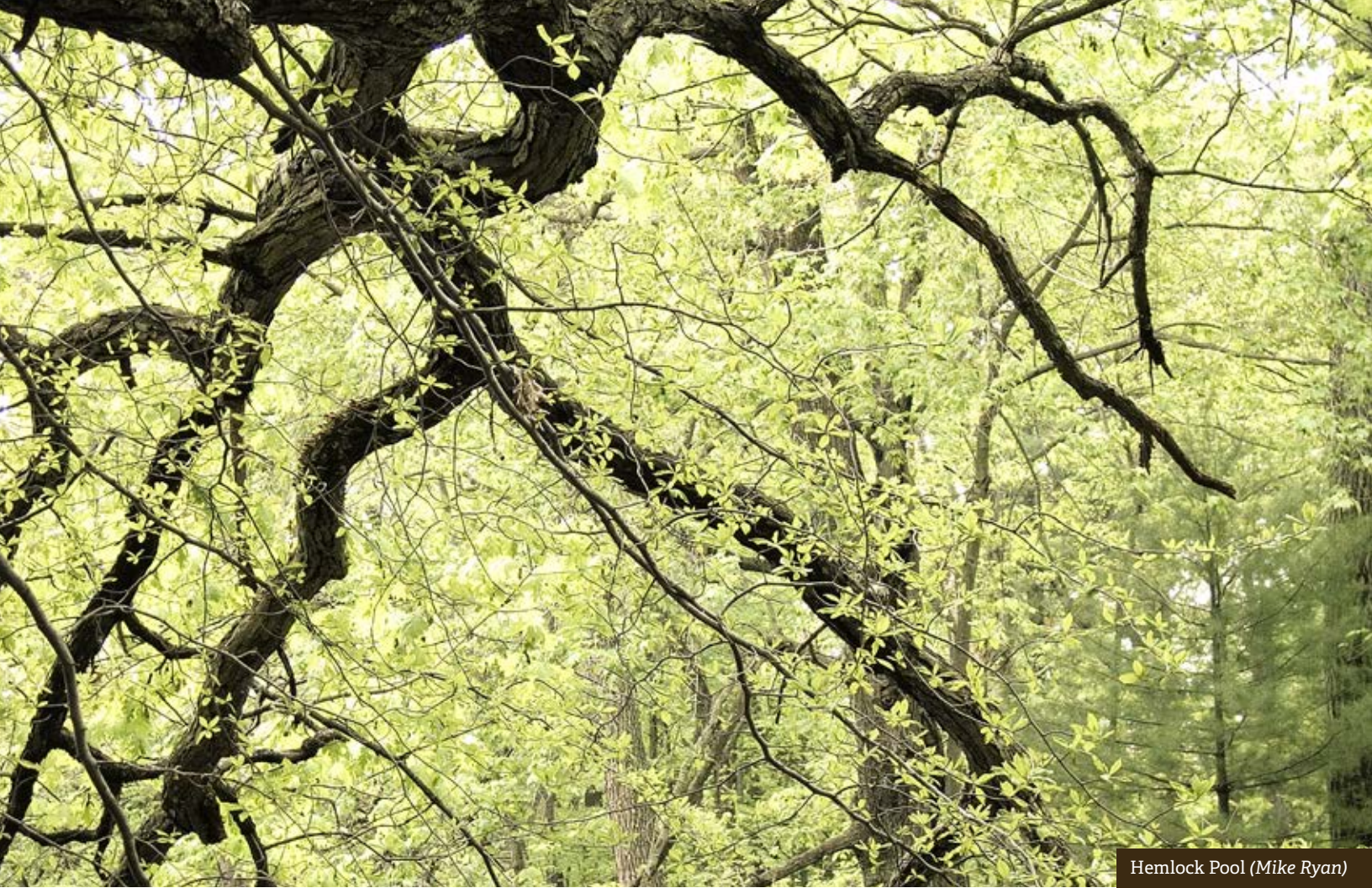
Hemlock Pool