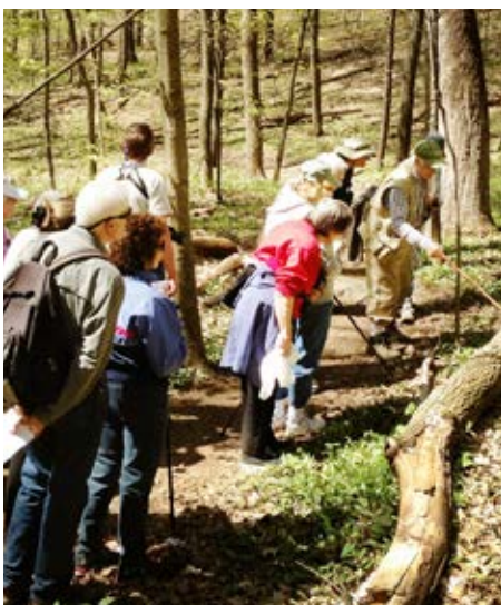
LEFT AND BELOW: Hike participants viewing early spring flowers near Bellevue Pond, including Trout Lily, so named because of the coloration patterns on their leaves. (Mike Ryan)