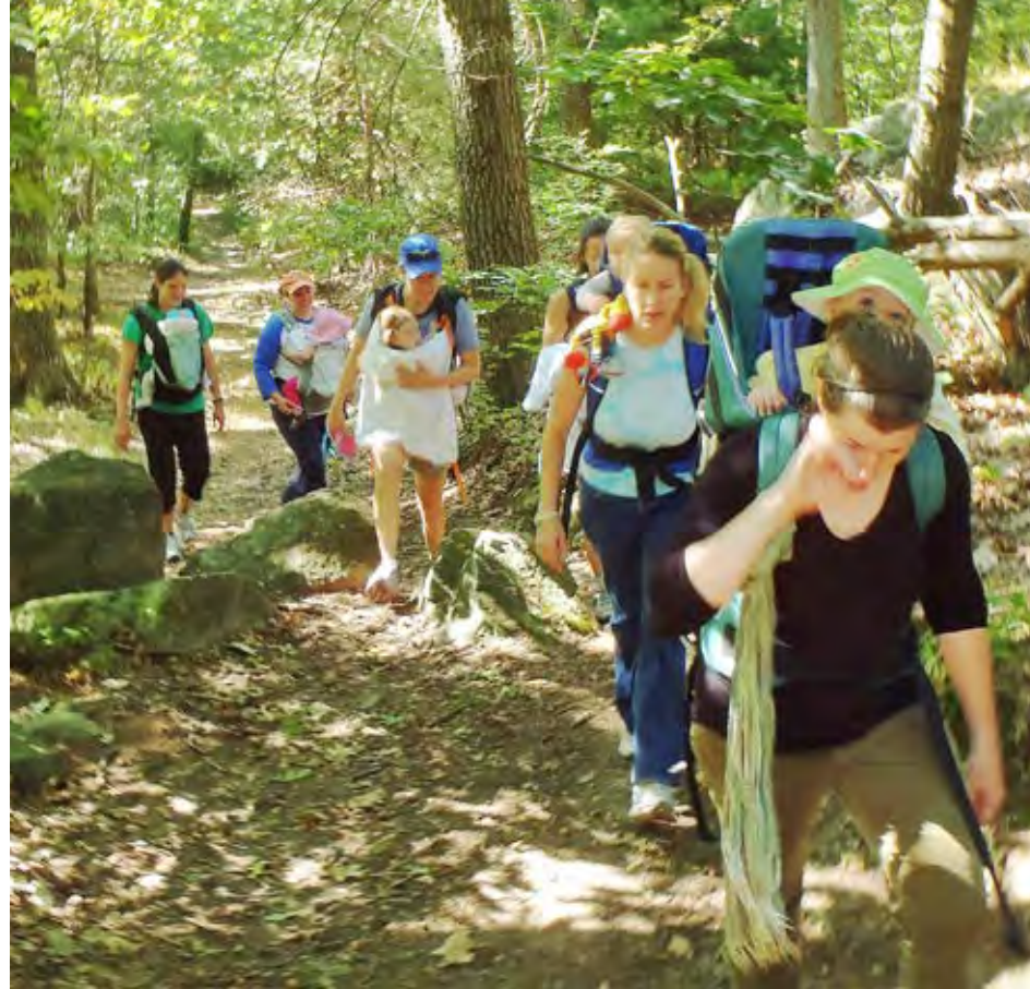
Spring awaits Babes hikers

For more information about the Babes in the Woods Apprenticeship Program contact Friends of Fells at 781-662-2340 or email at fells.org .