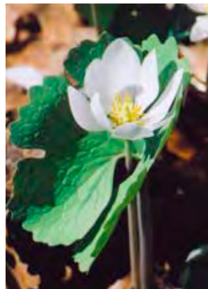
CLOCKWISE FROM UPPER LEFT: Bloodroot, Hepatica, Marsh Blue Violet, Trout Lily, Smooth Alder Skunk Cabbage (Bryan Hamlin)

But in April a beautiful trio of flowers seem to 'battle' for who's going to bloom first and get the attention of the first brave bees: Hepatica ( Anemone americana ), Bloodroot ( Sanguinaria canadensis ) and Trout Lily ( Erythronium americanum ). Look for Hepatica on Bear Hill and a good place for the other two is near Bellevue Pond. By the end of April the attention-grabbing Marsh Marigold ( Caltha palustris ) will be blooming alongside streams, over-arched by Spice bush ( Lindera benzoin ) and Red Maple ( Acer rubrum ). Many early blooming plants are wetland plants because streams unfreeze more easily than the forest floor, transporting relative warmth through the area. By the end of April and into early May gorgeous violets (there are seven species in the Fells) will be appearing in many parts of the Fells. If I've caught your fancy, join me on my spring hikes or learn more at www.foundinthefells.com .