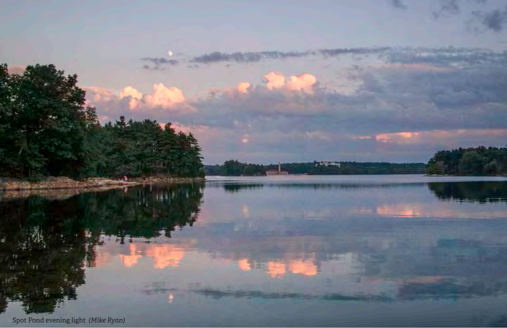
Spot Pond evening light (Mike Ryan)