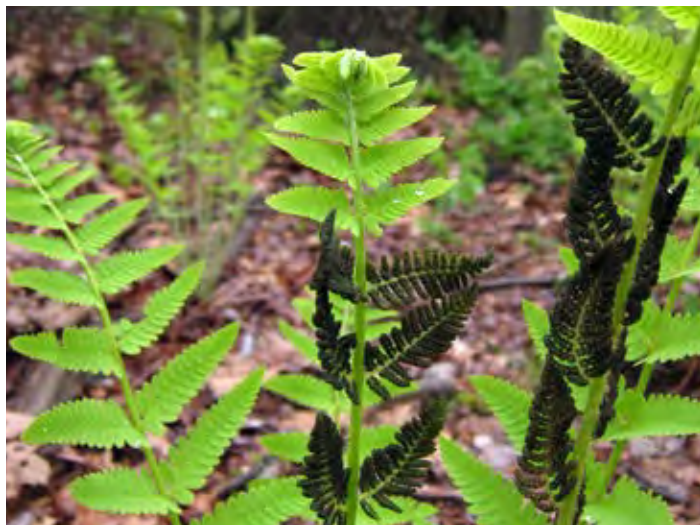
Interrupted Fern

leaflets interrupt the frond, not because it has poor conversational skills). Many of the species we encountered were culturally important. Others had thrived since the time of the dinosaurs.