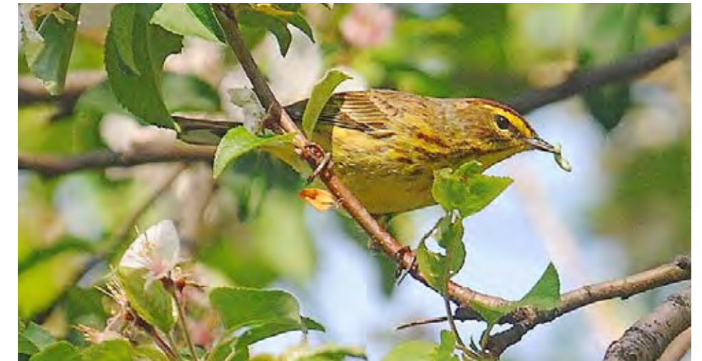
Palm Warbler