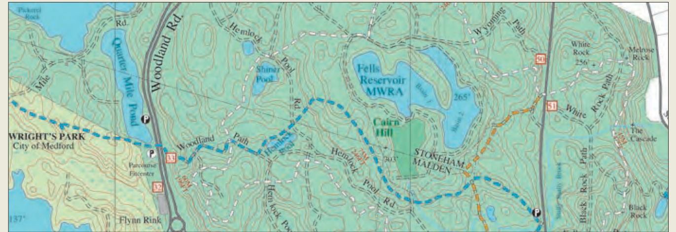
Fells Cascade pathway route today; note locations of points of interest described by the author in 1898

THE CASCADE ENTRANCE IS A NATURAL ENTRANCE, BETWEEN TWO BOLD ELEVATIONS — BLACK ROCK (243 feet) and White Rock — the “Twin Sentinels,” as they have been called, rising abruptly above the valley on either side of the steep and narrow passage thick with trees.