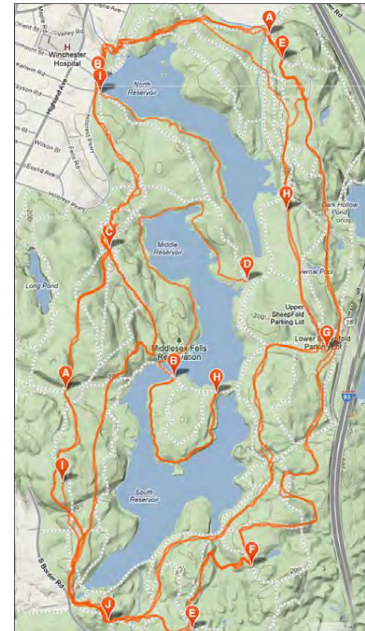
Strava website bike race trail sections in the eastern Fells